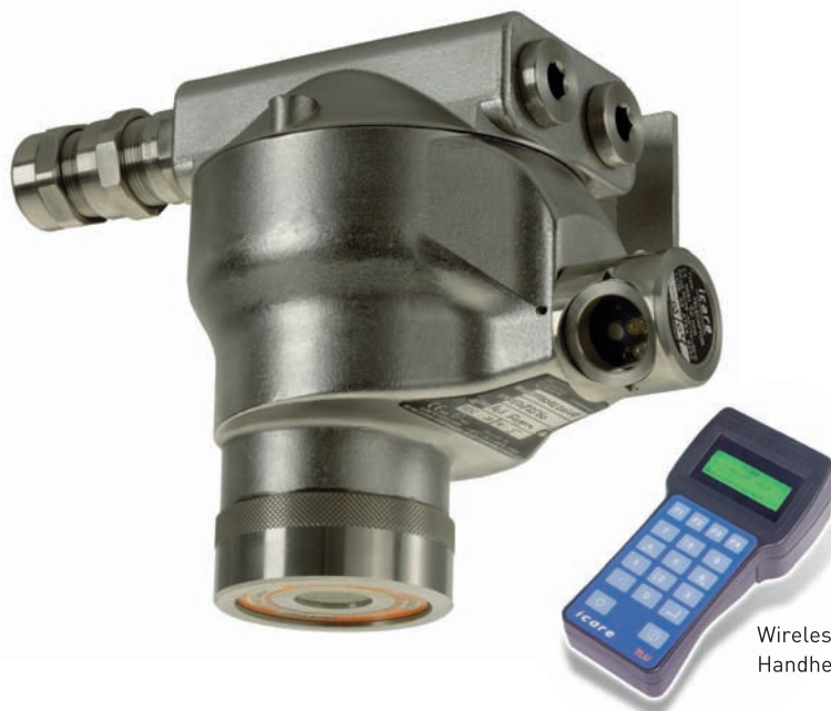
Wireless (IR) Handheld Terminal

Local LED alarm indicators, relays & 4-20mA output are available as standard