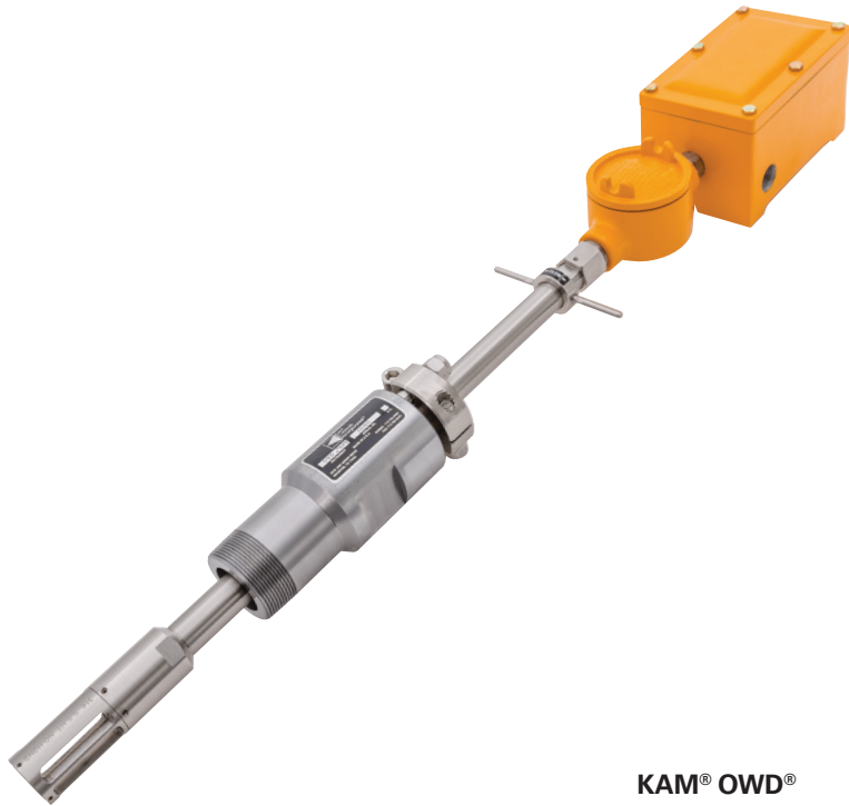
KAM ® OWD ® WATERCUT METER

Using multiple microwave frequencies, the patented multi-antenna design of the KAM ® OWD ® ensures consistent accuracy across the entire 0-100% range.